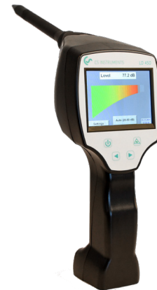
LD 450 with straightening tube and straightening tip for accurate detection.